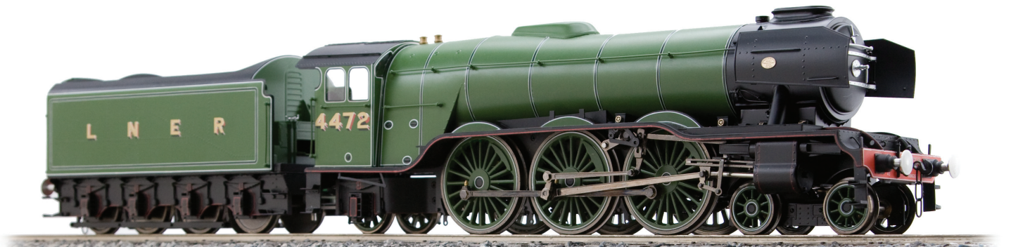
ELECTRIC MODEL SHOWN